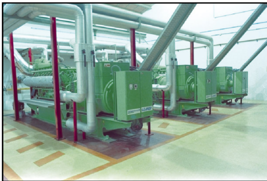
Total Energy Units