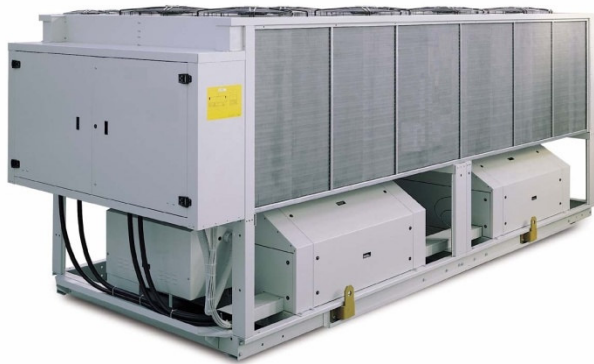
Industrial AC Units