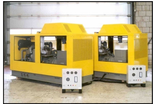
Generator Set Enclosures